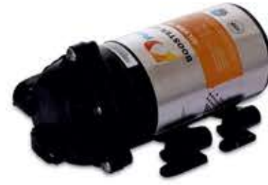
P Zone 100 GPD