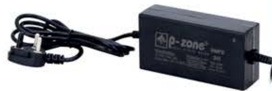
24 V. SMPS (2.5 AMP)