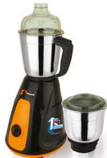
Model : PZ-2 Powerful Motor : 500 Watts