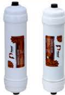
Inline Carbon & Sediment