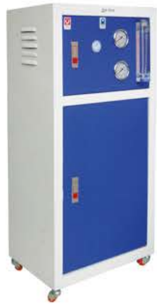
50 LPH RO Plant Covered