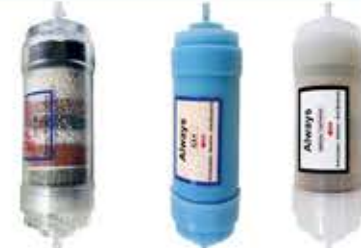
Bio AAA + Alkaline Filter