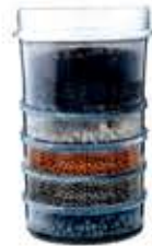
Mineral Cartridge fro Mineral Pot