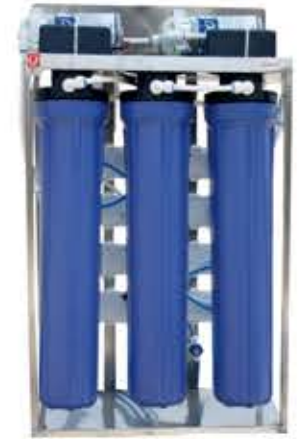
50 LPH RO PLANT