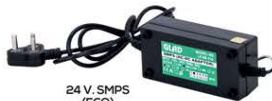
24 V. SMPS (ECO)