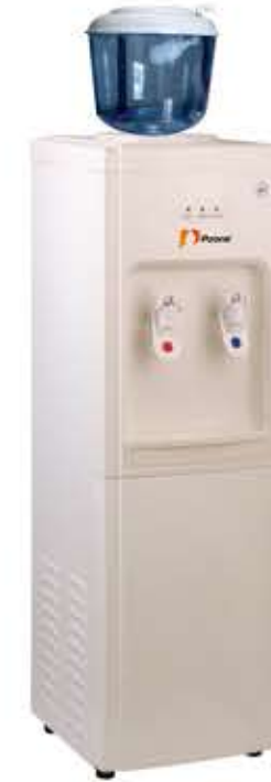
HOT & COLD RO Dispenser