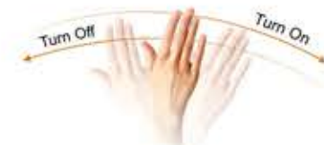
MOTION SENSOR WITH TOUCH CONTROLS