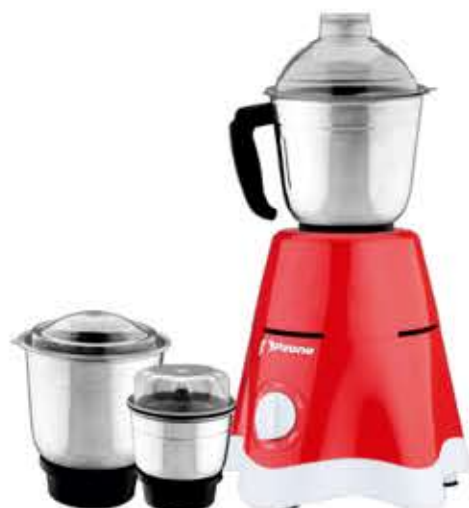
Model : PZ-1 Powerful Motor : 750 Watts