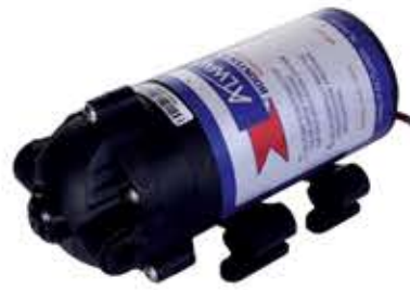
Always Pump 100 GPD (G Series)