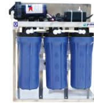
25 LPH RO PLANT