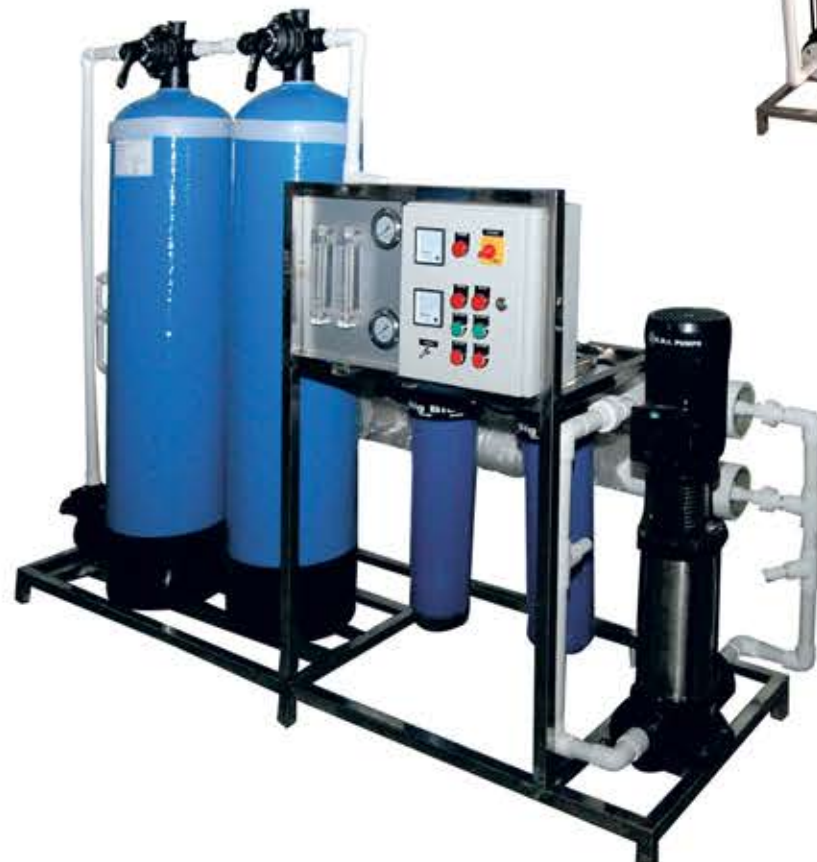
RO PLANT 1000 LPH