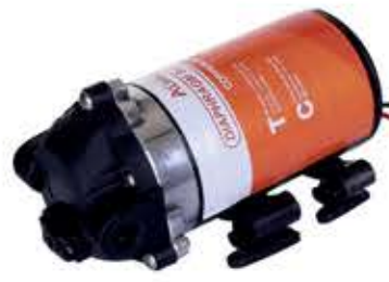
Always Pump 100 GPD (P Series)